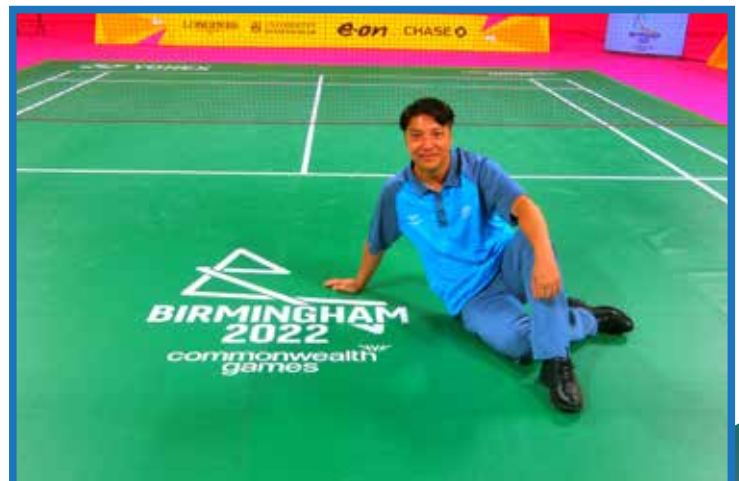
Birmingham 2022 Commonwealth Games