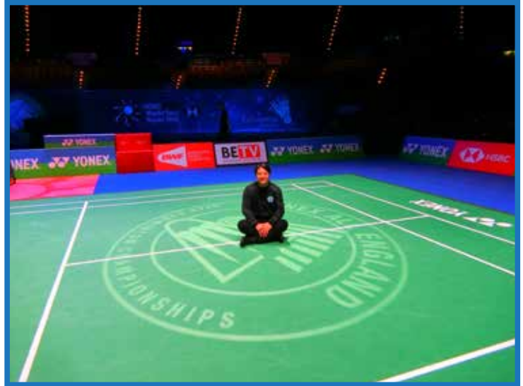
All England 2021