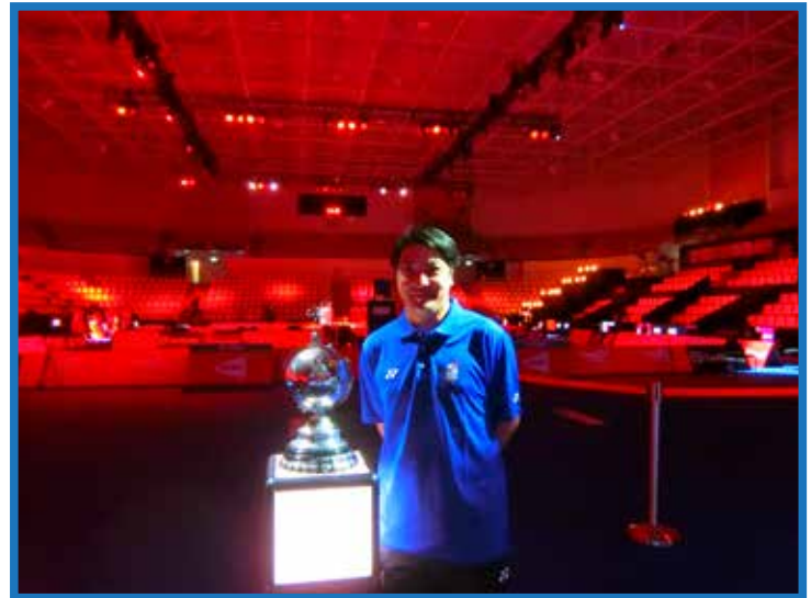
Thomas & Uber Cup 2021